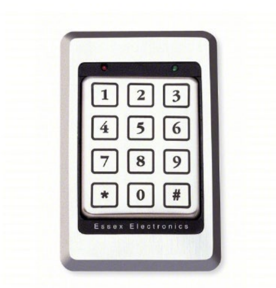
ESSEX Access Control SKE-34S